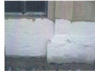
Figure 2. Treatment of Salt Desalination on Wall Surfaces Through the Process of Poulticing

The injection of a chemical damp-proof course is the cheapest and easiest way to provide barrier in masonry walls to prevent rising damp. The treatment has to be applied prior to the treatment of salt attack. Chemical injection is carried out by drilling into both sides of the affected walls. The drilling is usually carried out at intervals along the wall at about 6 inches from the floor to a particular depth (depending on wall thickness). A silicone-based chemical is then injected either by using gravity flow or pumps until it is saturated and forms a moisture barrier that later prevents any water or dampness from moving upward in the masonry walls.