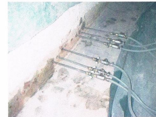
Figure 3. Treatment of a Course of Damp-proofing Through Chemical Injection